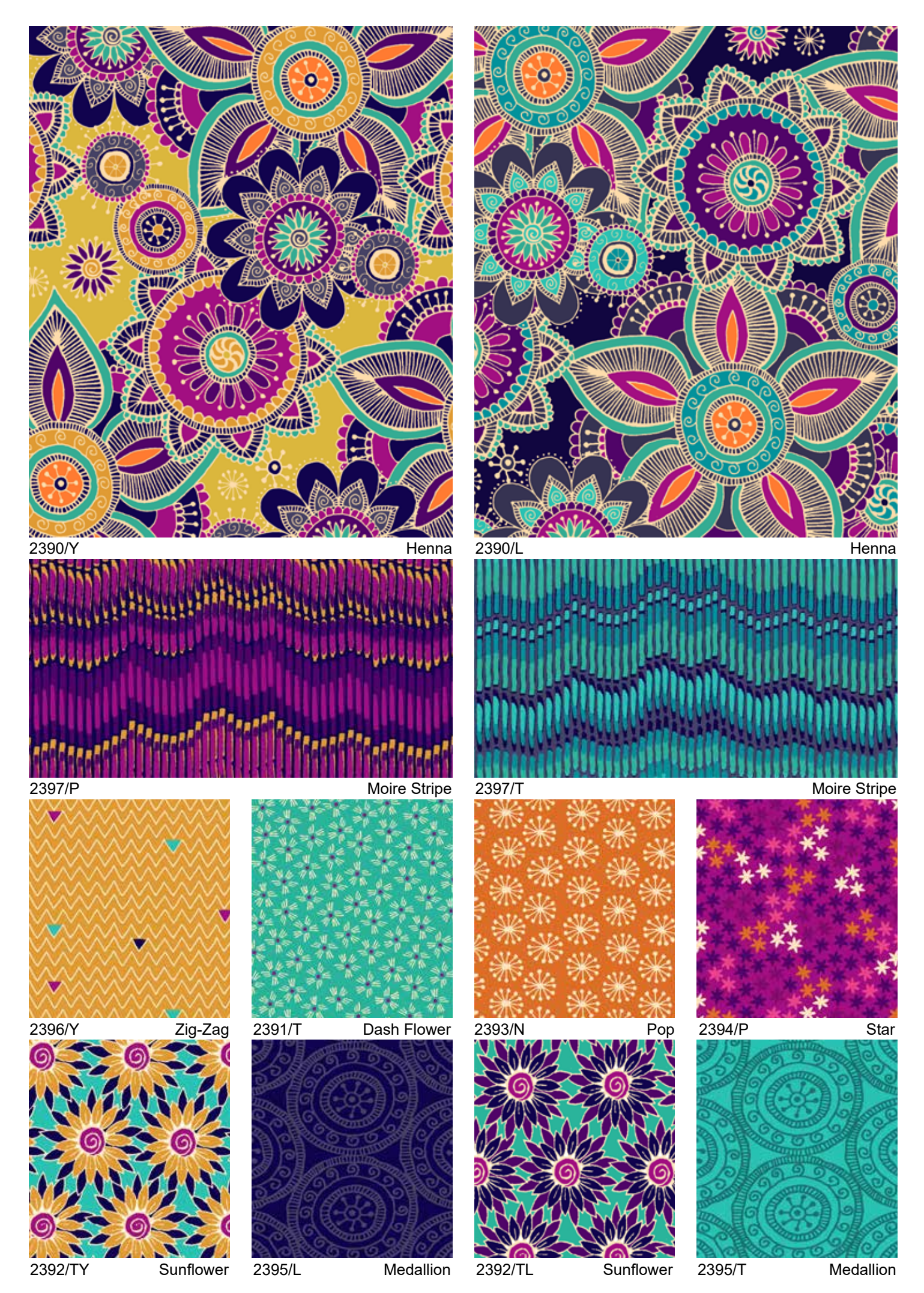
Images for reference only, not correct for actual colour or scale (approx 50%). For further info visit makoweruk.com